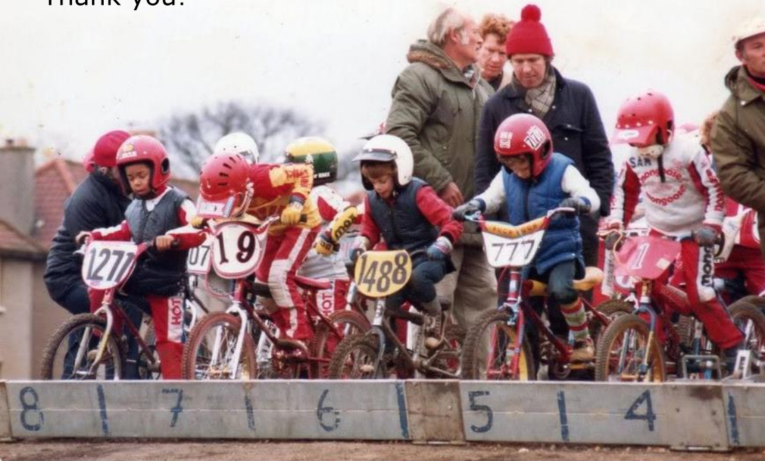
Landseer Park circa 1981